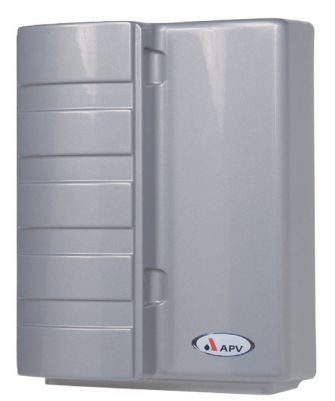
Cabinet for APV Compakva 36+

APV Compakva 36+ comes in shock-resistant packaging.